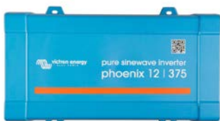
Phoenix 12/375 VE.Direct