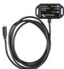
VE.Direct Bluetooth Smart dongle (must be ordered separately)

The BMV Battery Monitor features an advanced microprocessor control system combined with high resolution measuring systems for battery voltage and charge/discharge current. Besides this, the software includes complex calculation algorithms to exactly determine the state of charge of the battery. The BMV selectively displays battery voltage, current, consumed Ah or time to go. The monitor also stores a host of data regarding performance and use of the battery.