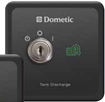
DTD02A discharge control with seacock warning light