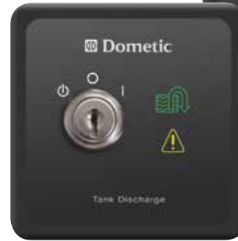
DTD Panel Dimensions – all models 3.25 in. w x 3.25 in. h / 83 mm x 83 mm